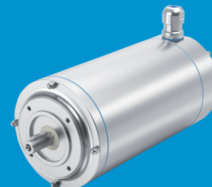
Stainless steel motor SBH