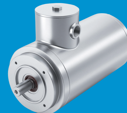
Stainless steel motor N