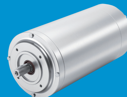
Stainless steel motor SBE